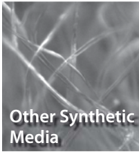
Other Synthetic Media